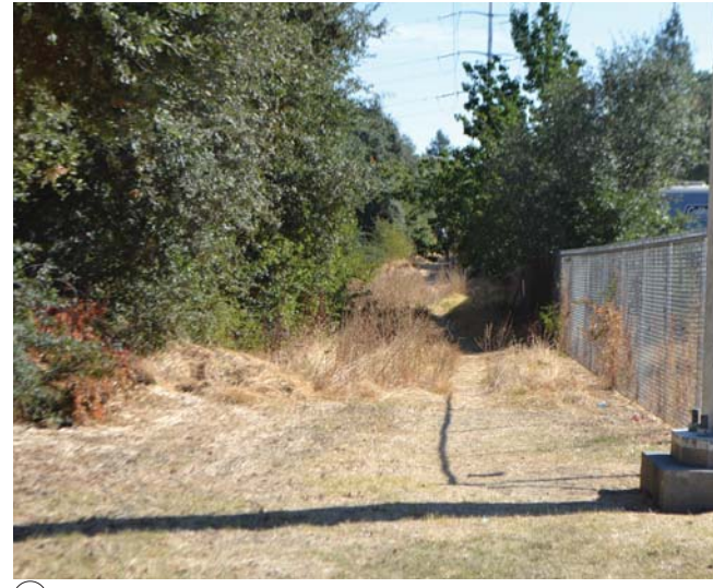
Typical Trail Alignment North of Woodmore Oaks - Existing