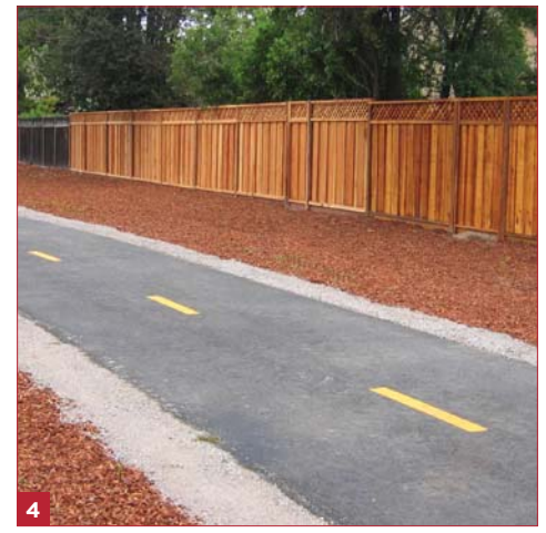
Privacy fence with access gates