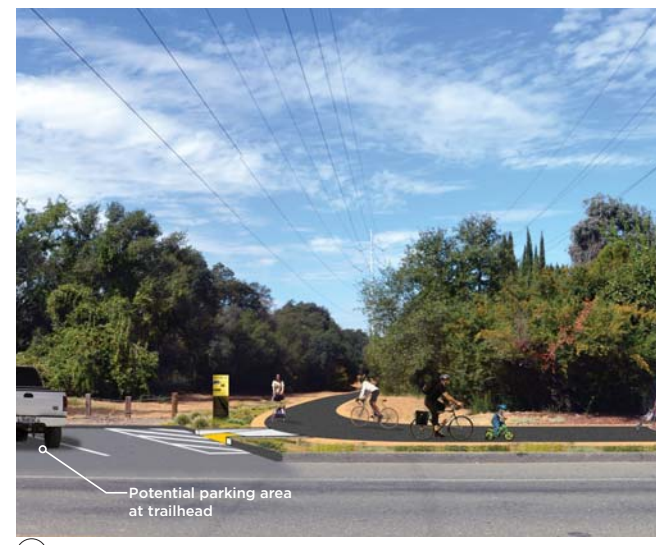
Alignment at Wachtel Way - Proposed