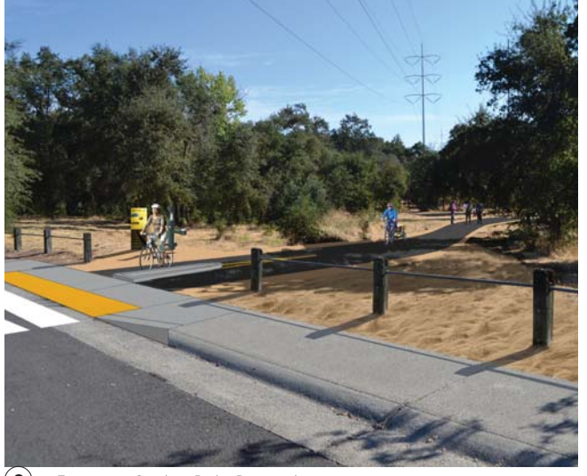
Entrance to Sundace Park - Proposed