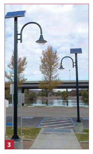
Pedestrian scale solar lighting