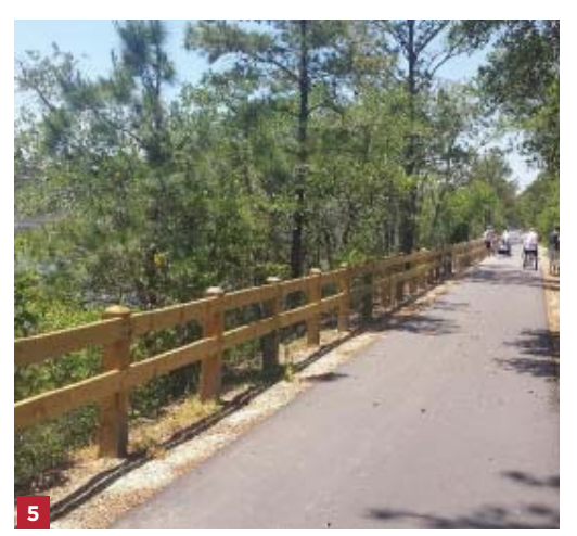
Split rail fence