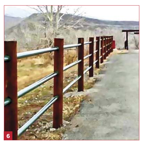
Wood post with pipe railing