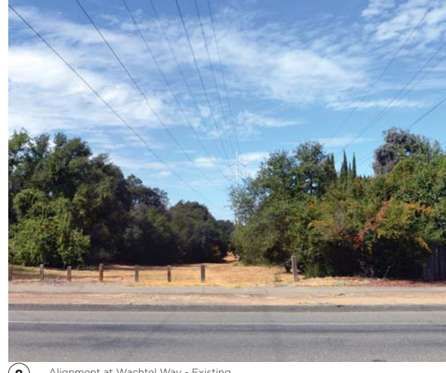
Alignment at Wachtel Way - Existing